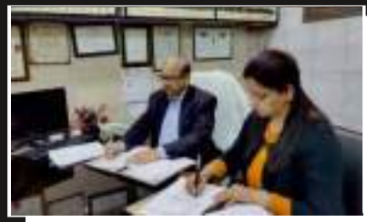
MoU with Chambers of Rai & Rai Partners