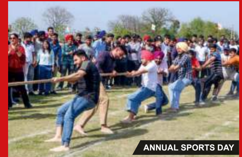
ANNUAL SPORTS DAY