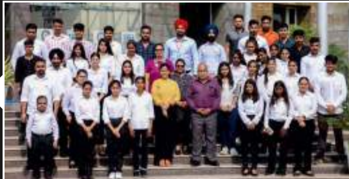
CT Youth Parliament on Model Lok Sabha

Students participated as Para Legal Volunteers DLSA, Ludhiana's Awareness Programmes under Gol's initiative of PAN India Awareness Program.