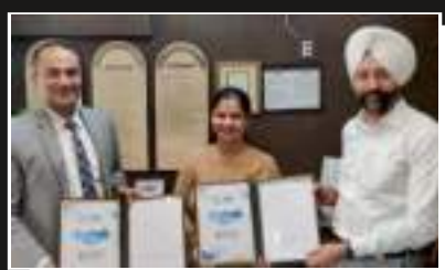
MoU with Chambers of R.S. Law Associates