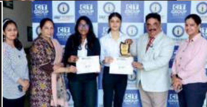
Best Debaters in "Robomania2022"